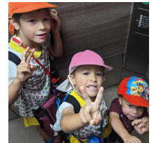
Heading to Kindergarten