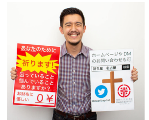
Sign on left: I will pray for you (free) Sign on right: you can also send us a message online