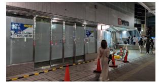
First floor location we were looking into

I recently began a new way of trying to meet people in our city. Realizing that there are people whose job is to listen while people talk about their problems, I decided that we could listen AND pray . Holding up a sign that says "I will pray for you" I have been able to talk to several folks on the street. Please pray for wisdom and that we can effectively minister to people through this and reach them with the Gospel.