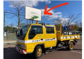
Foul Play – The city decided to tape up outdoor basketball nets at this park during the special prevention measures

Please continue to pray with us as we work here in Nagoya. We will need wisdom getting adjusted to having 3 kids and navigating the weeks ahead that are being affected by covid.