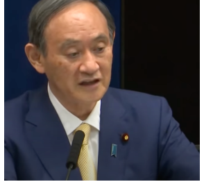
Prime Minister Suga announcing the 4th state of emergency

However, Aichi prefecture (where Nagoya is) has not been included in this 4th state of emergency. Additionally, our re-entry will not be hindered by this state of emergency . While the circumstances are not optimal, we praise the Lord that the door is still open for us. Please continue to pray with us as we wrap things up in the states to go back at the end of August!