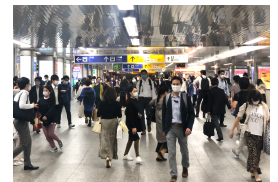
People crowding through Yokohama station. Taken on a recent survey trip.